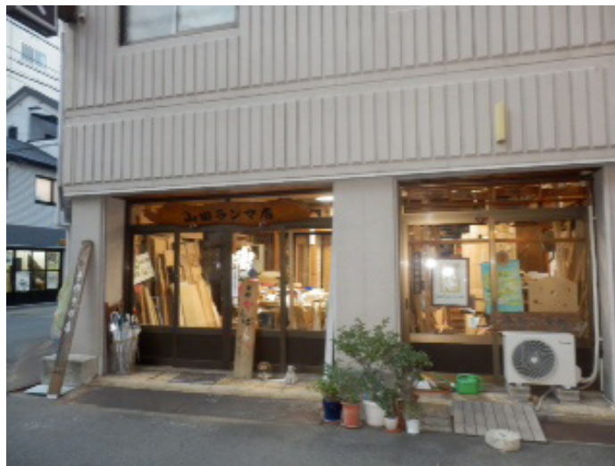
Figure 4. A Fanlight Shop as a Remaining, Old Business

An interviewee interpreted Orange Street as a mistake because it did not turn out to be the "reactivation wished for by the furniture dealers". He likened the situation of the furniture dealers who closed down or rented their shops to "squeezing one's own neck" (M1 2013). The initiators of change are now trying to correct the mistake, through measures such as Horie Union's efforts to prevent unrelated businesses from coming in further.