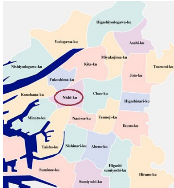
Figure 2. The Location of Nishi Ward in Osaka City