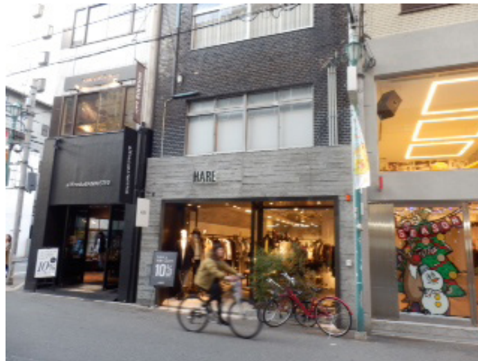
Figure 5. Apparel Shops on Orange Street

On the other hand, they were also concerned about a possible deterioration of the area, related to the loss of place identity and function. They feared the possibility of higher rates of crime and an intensification of the schools' capacity problem, if the area became more popular and crowded. Furthermore, they worried about young residents of the newly built mansions, considering that they were prone to think, "Why should I pay neighbourhood expenses, when I don't participate?" (I2 2013). Unless older members were replaced by newer members for neighbourhood duties, it would be difficult to keep the "safe and peaceful city, created and maintained by the efforts of the old people" (M2 2013).